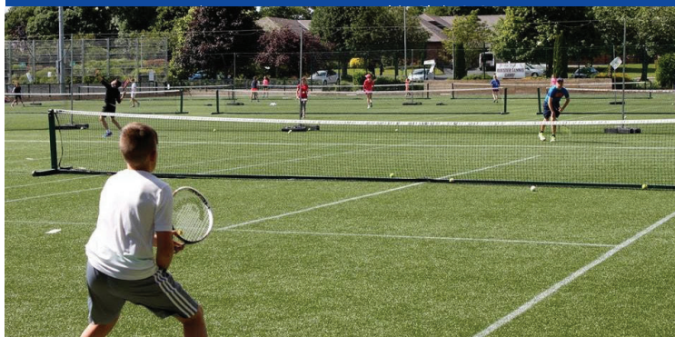
Afternoon match play at Bolster Tennis Camp

We would like to sincerely thank you and all your team for what was an incredible tennis camp. What an amazing role each and everyone played. We would like to pass on our genuine gratitude and utmost praise to all involved.