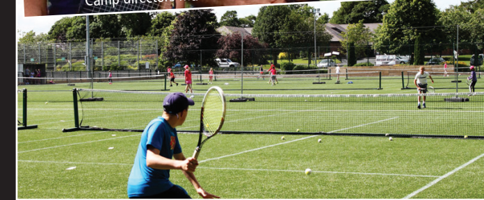
Excellent Accommodation and All new Tennis Facilities at Kilkenny College